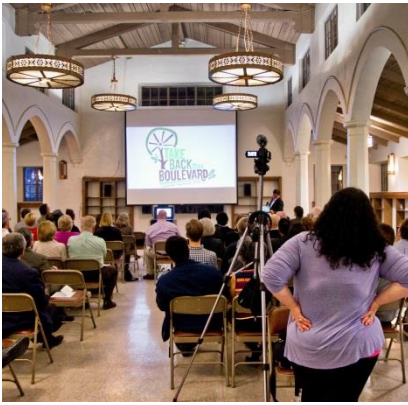
State of the Town Meeting

The community beautification initiative known as “Eagle Rock Make Art Not Trash” was an extremely popular