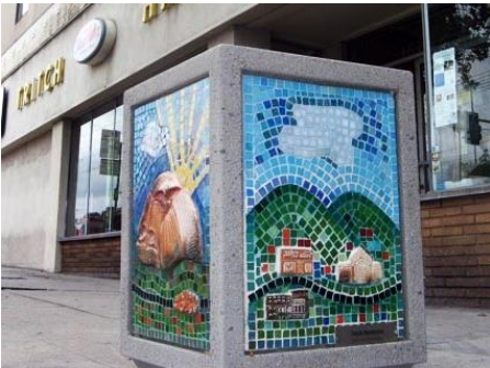
Tritch Hardware Design

The community beautification initiative known as “Eagle Rock Make Art Not Trash” was an extremely popular