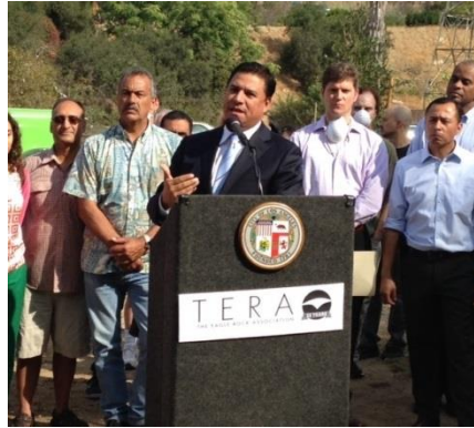
Scholl Canyon Protest

capacity and life of the Scholl Canyon Dump, which is located adjacent to our